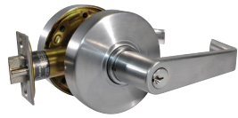
5000LE Entrance Function Shown in 26D Finish

The 5000-Series cylindrical lever locks are designed for high traffic applications. They are tested to last more than 4 million cycles. These heavy duty locks come with a popular flat rose design and a lever that is compliant with ADA and other accessibility codes. These locks are recommended for use on exterior and interior doors. Typical applications include Offices, Hospitals, Schools, Multi-Family Buildings, and Public Buildings.