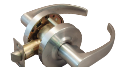
310SO26D2-3/4UL Sonoma (SO) Shown in 26D Finish