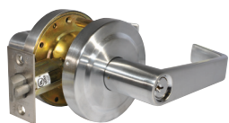
300MA26D SC2-3/4UL Madison (MA) Shown in 26D Finish

The 300 Series locks are designed for use in a variety of commercial applications. Equipped with a U.L. listed latchbolt, these locks can be used on 3-Hour fire doors. Built with independent return springs in each lever and with an optional clutch feature to protect against excessive torque, these levers resist sagging. The L-shaped lever design with less than 1/2" gap between the handle and the door meets most accessibility codes.