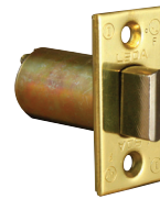
234SL & 238SL