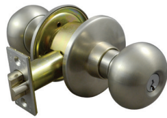
Plymouth (P) Design Shown in 32D Finish