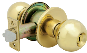
Ball (B) Design Shown in 3 Finish

LH-Series cylindrical knob locks are designed for high traffic applications. Two knob designs make these an easy retrofit in many places that do not require levers for accessibility. These locks are recommended for use on exterior and interior doors. Typical applications include Offices, Hospitals, Schools, Multi-Family Buildings, Industrial Sites, and Public Buildings.