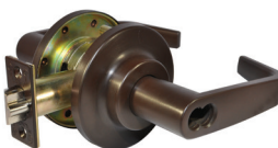
LF2000 IC (SFIC Option) Shown in 10B Finish