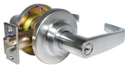
LF2000 (Entrance Function) Shown in 26D Finish

LF-Series cylindrical lever locks are designed for high traffic applications. Unique cold-rolled steel spindles withstand up to 1000 inch-pounds of torque and the lever is compliant with ADA and other accessibility codes. These locks are recommended for use on exterior and interior doors. Typical applications include Offices, Hospitals, Schools, Multi-Family Buildings, Industrial Sites, and Public Buildings.