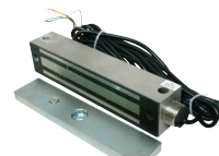
BMAG600WP C 600 lbs. Holding Force Weatherproof, Aluminum Finish